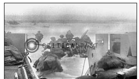
Different fogbound background. Photoshop brings forth a single building that swings across the scene to the left. Steady image. Radio equipment is seen on the back of soldiers. Group of soldiers wades towards the shore.