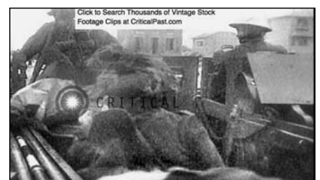
Bernières is again in the background with what should be Queen's Own Rifles disembarking. Second image shows (North-shore?) soldiers moving in from right from another landing craft. Last seconds proves camera is also mounted to deck.