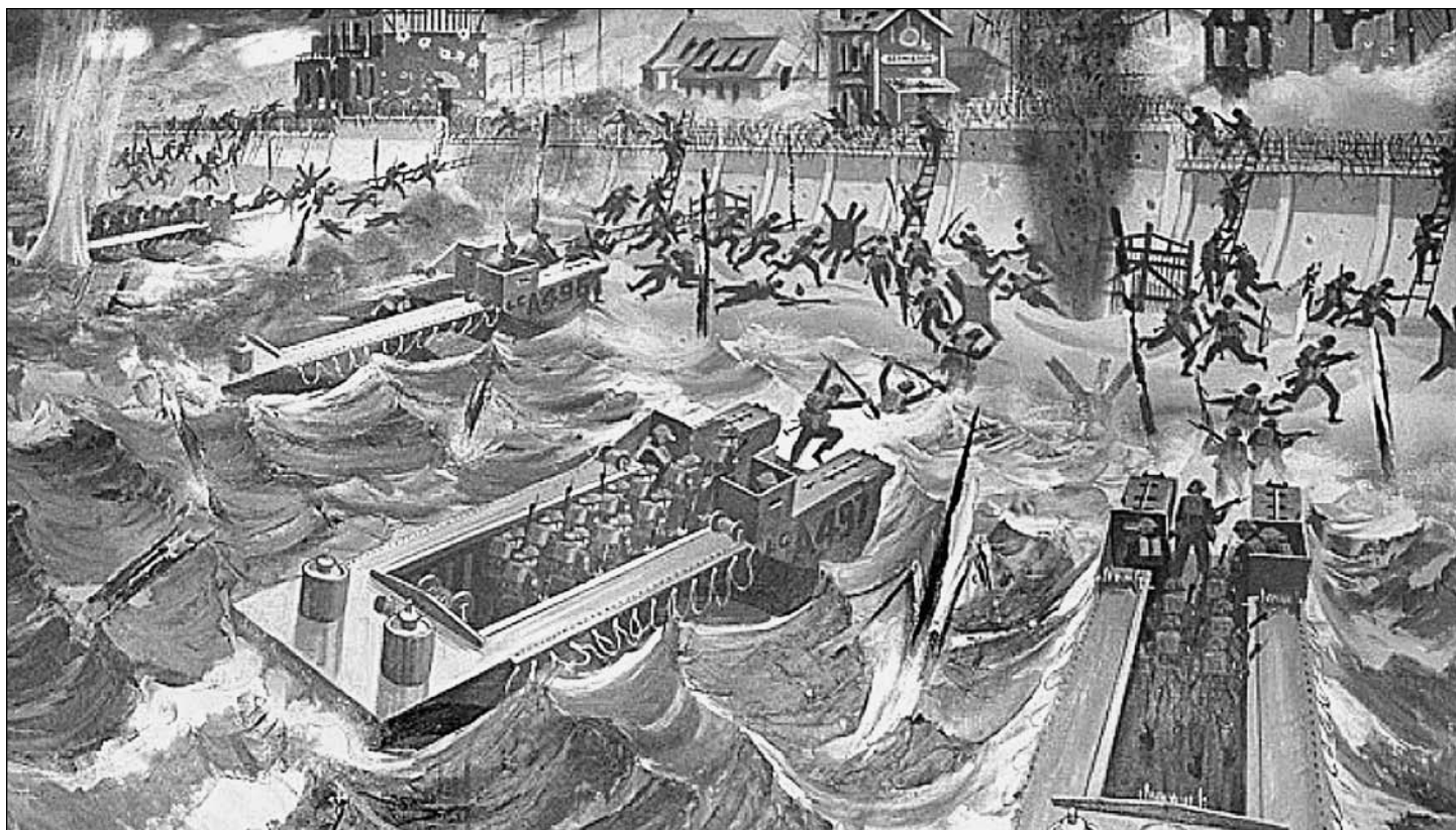
Depiction of Canadian troops landing on the beaches of Bernières-sur-Mer on June 6th 1944.

The story of ciné photography of the D-Day landings by Canadian troops, June 6th 1944, is repeated, it seems, every 10 years as new information and analysis becomes available. We hope with this presentation we will understand the truth. Cameramen of the Canadian Army Film and Photo Unit daringly scooped all others with their footage of the first-wave landings at Bernières-sur-Mer.