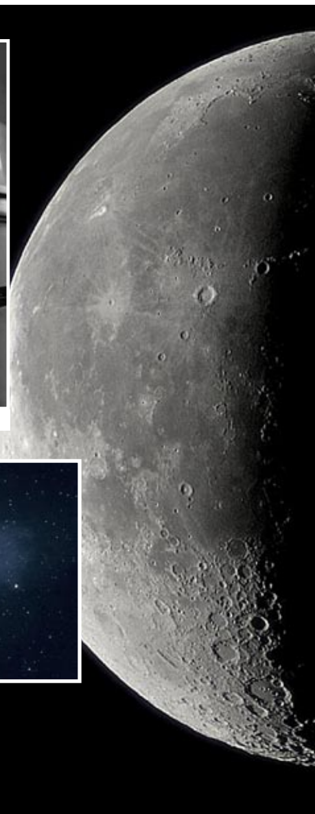
ASTRONOMY PHOTOGRAPHS

Meetings held in the Gold Room, (basement) of the North York Central Library, 5120 Yonge Street. Handy TTC Subway stop at the library door also plenty of underground parking