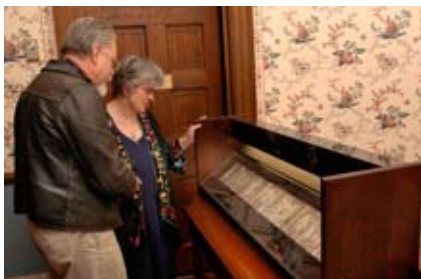
Exhibits include this display of modern daguerreotype portraits by M. Robinson.