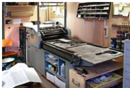
The Vandercook Universal 3 press