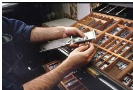
Hand setting of type for headlines