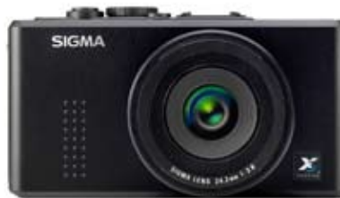
THE SIGMA DP2 COMPACT

a good knock to seal it tight. When something catches your eye, simply remove the magnetic strip covering the pinhole to take the shot. Depending on the lighting situation and the type of media you are using, exposure can range from a few seconds to a couple of minutes. Urbanoutfitters is retailing this “camera” for US$20, but if you have an empty paint can lying around at home, you could probably do-it-yourself for less than a dollar.