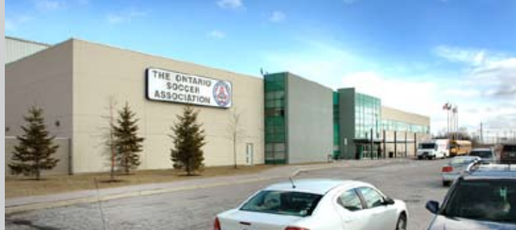
THE SOCCER CENTRE, 7601 MARTIN GROVE RD. JUST SOUTH OF HWY 7 ON EAST SIDE

Spacious, well-lit and with plenty of FREE parking. Doors open at 10:00 AM running through to 3:00 PM. Entree fee $7.00.