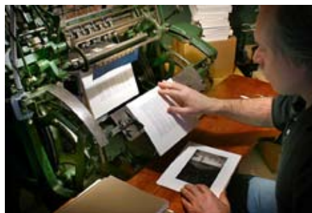
Feeding the Brehmer stitching machine

a year – even calling the factory in Germany, but the data had been lost in the war. Perseverance paid off and he now has the stitching machine working.