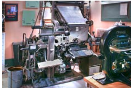
The Intertype typesetting machine

Like the printing, his early books were all hand stitched. He eventually found an old Brehmer Stitching machine, but had no idea how to operate it. He puzzled over this strange machine for over