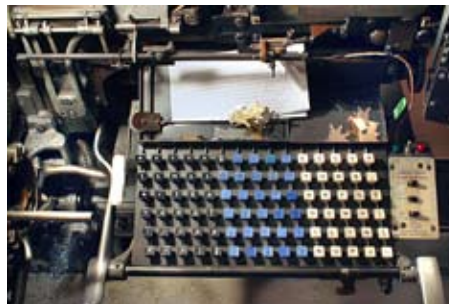
Keyboard for the Intertype machine