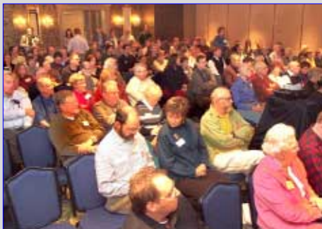
Members gather for the series of lectures that lasted throughout the Saturday.