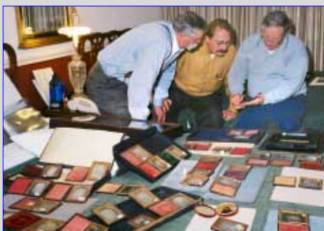
Room hopping was an attraction during off hours of the symposium as dealers offered extra time to inspect their wide choice of images and swap collecting stories.