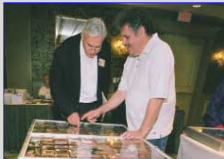
Tables lining the trade show were covered with luxurious images. Cased daguerreotypes are the feature but ambrotypes, tin and paper were on hand for collectors.