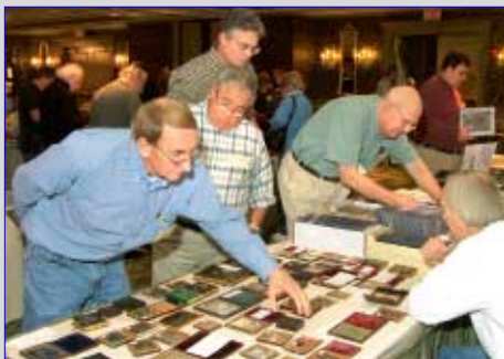
The trade show is a wonderful sight with thousands of gleaming images for sale.