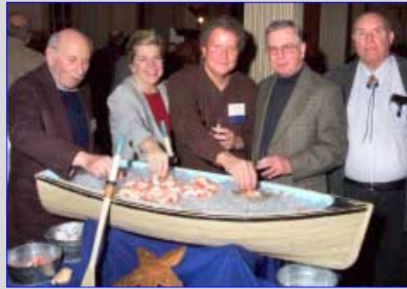
There's nothing like a feast of fresh shrimps to start a New England party.