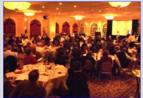
The annual banquet featured both a silent and a live auction to raise Society funds.