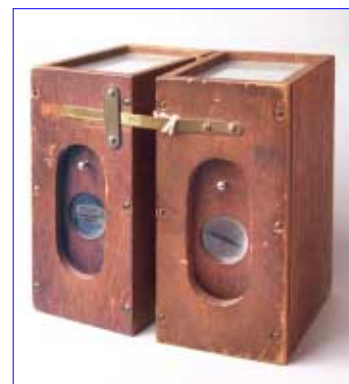
"VERMEER" CAMERA c 1906

Les Jones is preparing an article on this "Vermeer" camera (see below) and would appreciate any information or citations our readers can offer. It is understood that the 17th century painter Vermeer used a camera obscura to map out his paintings. This double optical box c1906 was used in art training schools, aiming one lens at the subject and the other lens at the art in preparation. Comparing images in the ground glass viewing areas aided students to achieve life copies. Contact Les by phone at (416) 691-1555 or email at lesjones@ca.inter.net