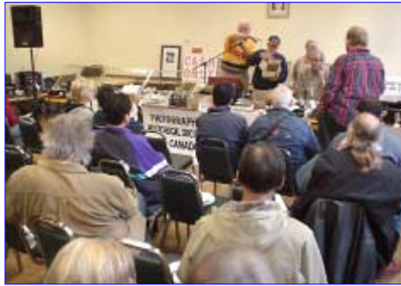
The scene of the auction at the Canadian Legion Hall on Lakeshore Blvd. in Toronto.

the team to sort everything into "auction worthy" lots, to describe and tag and then move to the auction site.