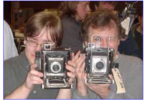
Seeing stereo as two press graphics attracted attention from young bidders