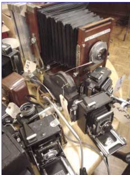
Speed Graphics, Rolleiflexs, a studio-size commercial Deardorff camera, cine cameras and much more, tempted those who attended the sale.