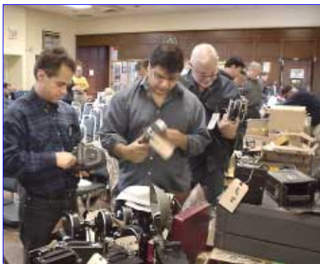
Taking a close scrutiny of collectible and user cameras that had accumulated in the Boccioletti collection. It was up to the buyer to inspect items before bidding.