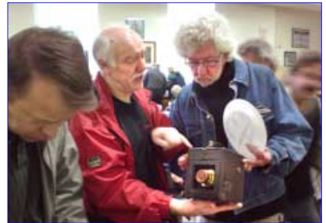
A Super D Reflex Graphic with an old brass lens is checked out by visitors.