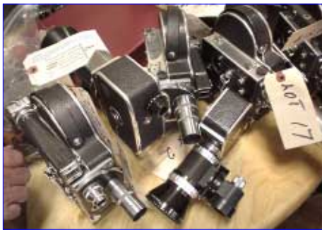
A good selection of movie cameras were available for bidders to select from.