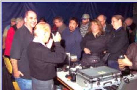
Were you there to get your picture taken? Vendors were pleased to demonstrate.

Our photographic report shows some of those who were on hand along with a few of the choice items that our photographer spotted on the tables. Despite digital impact the trends for working as well as collectable cameras is still steady. The film camera will maintain its collectability.