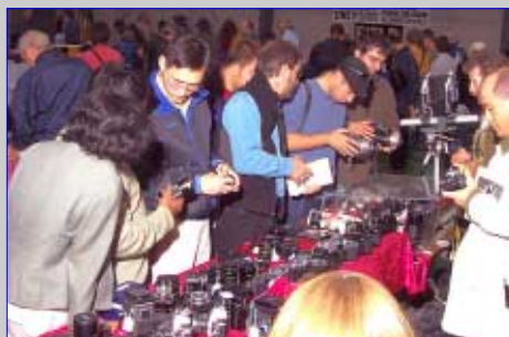
Enthusiasm reigned as camera collectors sleuthed through wide selection of goods.