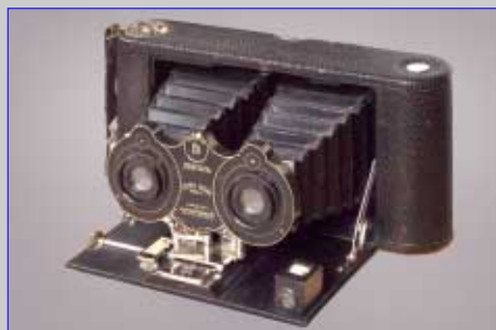
John Linsky displayed Eastman Stereo Hawkeye Model 1 for 3 1/4 x 4 1/4 pairs.