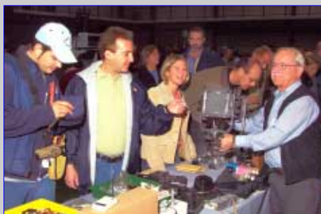
Checking out the cameras big and small as collectors crowded the tables for bargains.