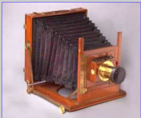
Nik Njegovan displayed "Victo" Triple Extension field camera, Busch Aplanat lens.