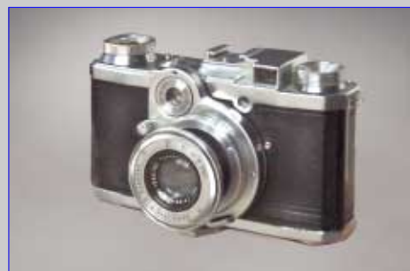
This Zeiss Ikon NETTAX with a 5 cm f2.8 Tessar lens attracted collectors at the show.