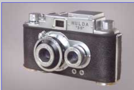
The twin lens HULDA-35 has pop up view-er for right lens, same as Toyocaflex 35.