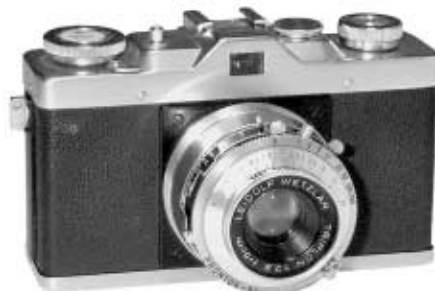
Correct image – OPTINA 35mm LOT 288 on page 42

The listing for LOT 276 of the Universal Vitar as seen on page 20; this item is not Japanese and should be located on page 27 with cameras produced in the United States.