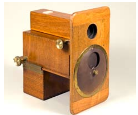
Image of No. 4 Patent Academy camera Variations of fittings exist.