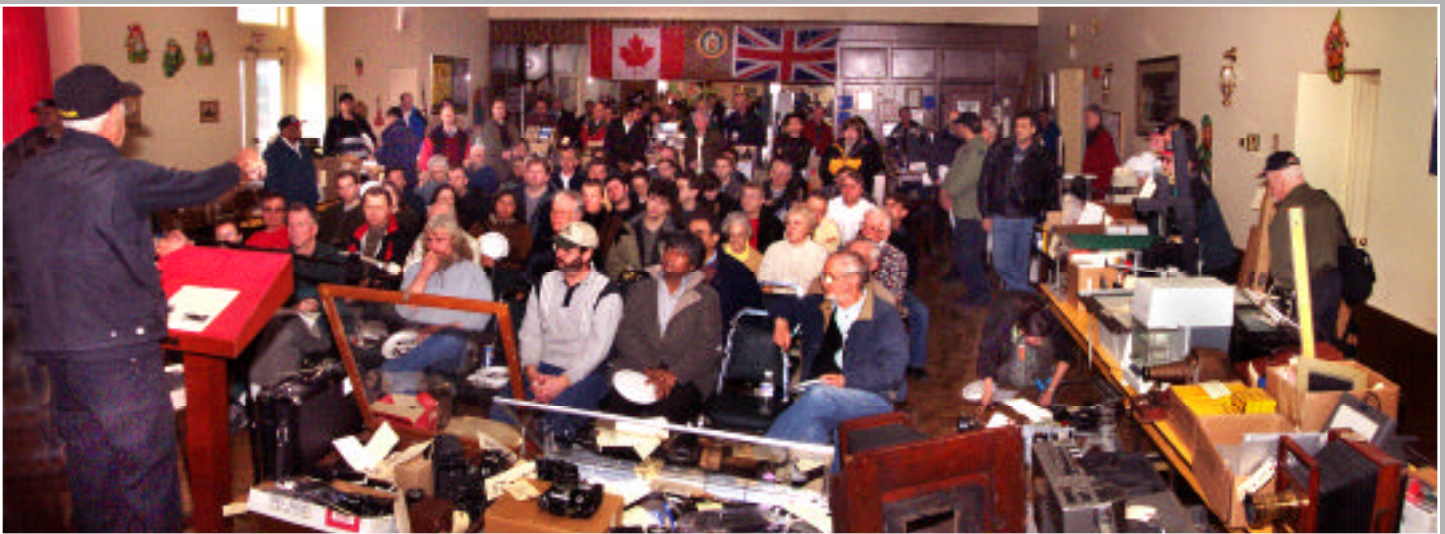
Crowd of 130 (approx.) responds to the urging of the auctioneer as they are surrounded by photographic collectibles