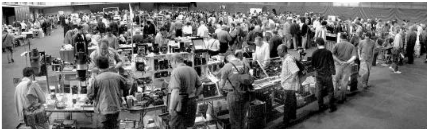
A VIEW OF THE DEALER TABLES ON THE SOCCER FIELD FLOOR AT LAST YEAR'S SPRING FAIR