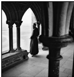
Entre deux mondes

He began his work in India, a country for which he has a particular affinity, where he produced several photographic series. He then left for Jerusalem, where he photographed the real or imagined partitions that divide the city. Later he followed his father during his last year of practice as a country doctor in Brittany, and then his successor. In recent years he has been working on a series entitled « Between two worlds », which shows how two different worlds may coexist unaware of each other's presence. Within the same city or the same place, men and