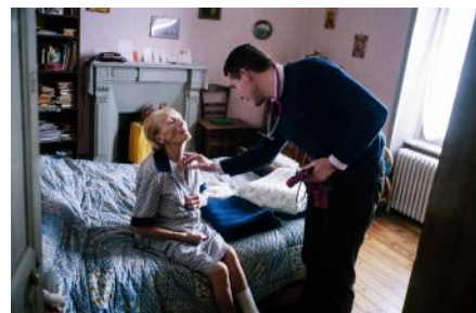
Médecin de campagne