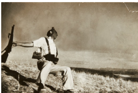
Image material may only be used in connection with coverage of the 18th WestLicht Photo Auction (23 November 2018) . Images must not be cropped or retouched. Image files must be removed from the archives after use.